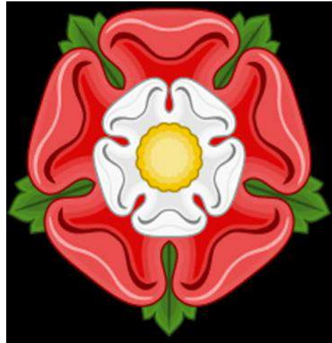
The Tudor Rose: a combination of the Red Rose of Lancaster and the White Rose of York

When he died in 1509, the country was by past standards wealthy and the position of the king was good. The barons by 1509 had been all but tamed. Many barons believed that it was better to work with the king than against such a powerful man.