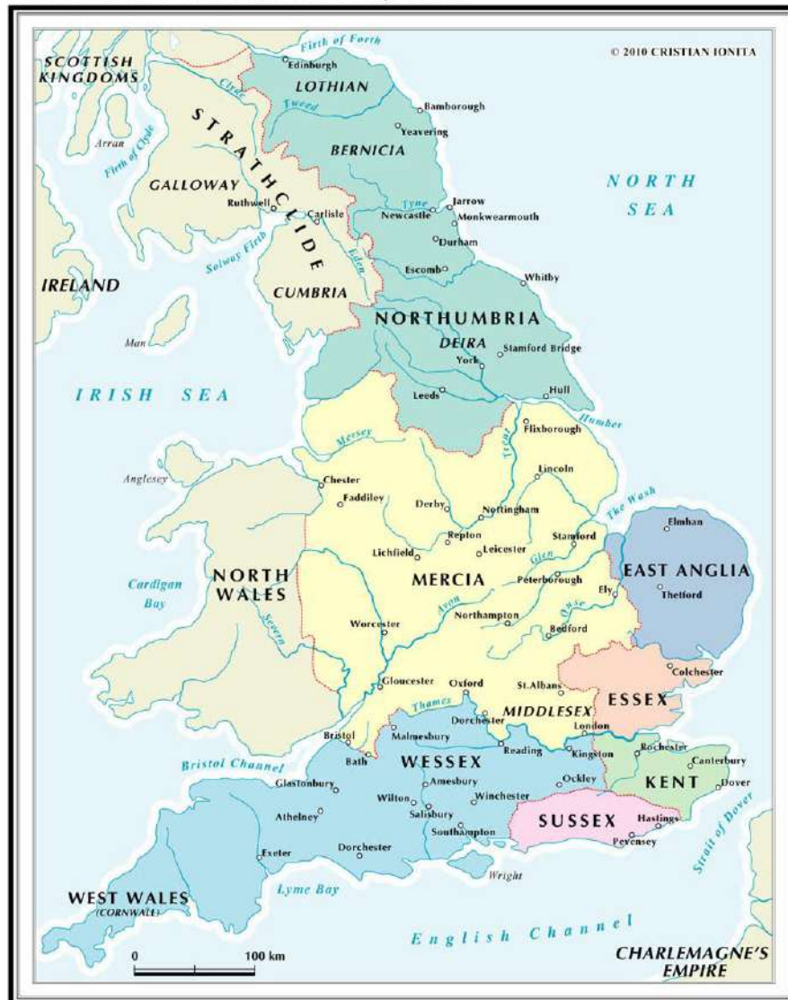
THE ANGLO-SAXON KINGDOMS, CA. 800

Some grew stronger and some consolidated power while others stayed aside. The strongest of them were Northumbria, Mercia and Wessex. In the end one dynasty – the House of Wessex emerged to establish a monarchy which has been an unbroken line from the 9th century to the modern queen and her descendants.